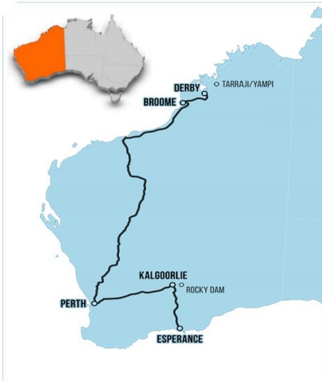
Figure 1: Yampi and Rocky Dam project locations